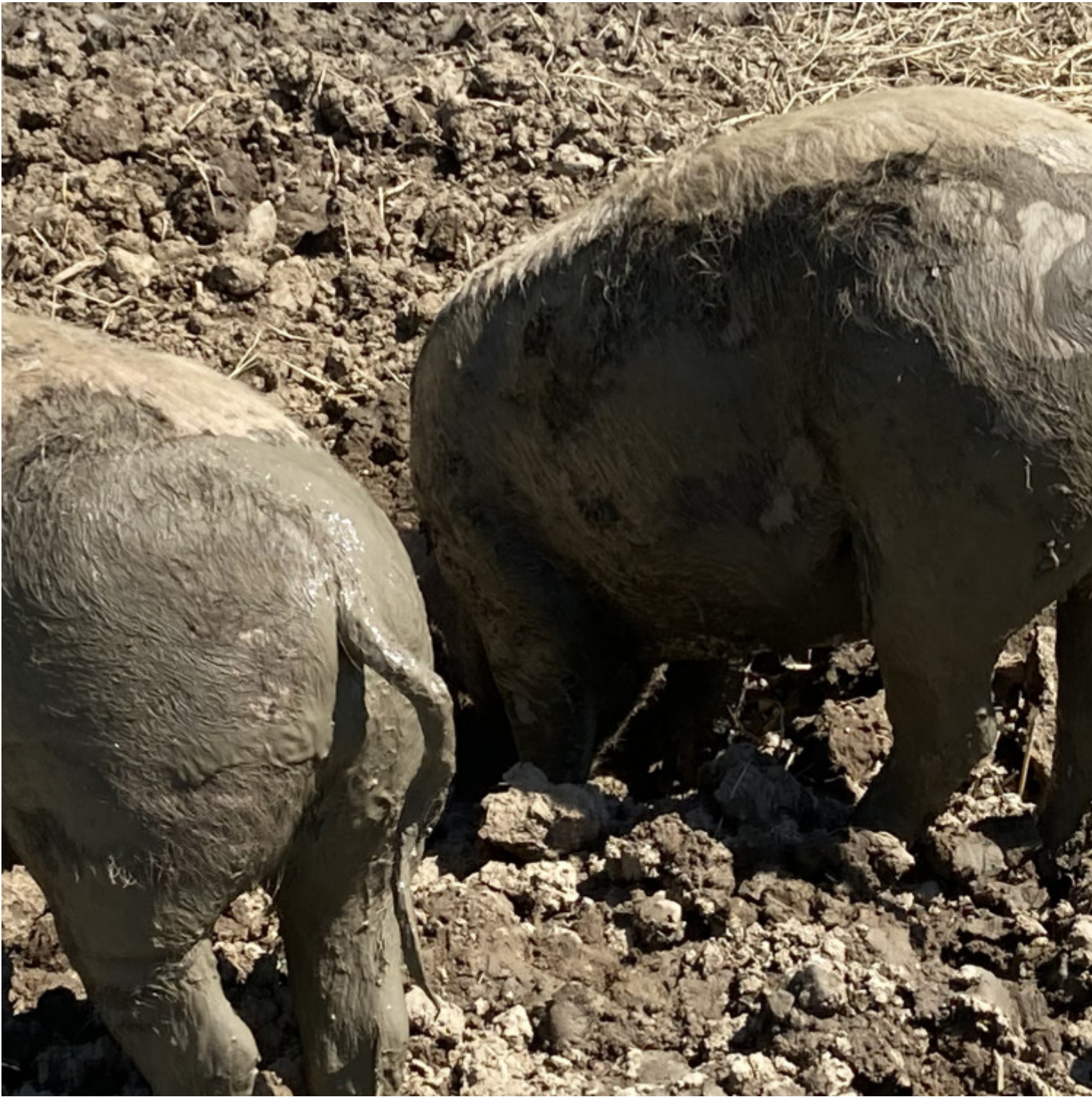
Biodynamic farm Les Eterpis, ploughing pigs