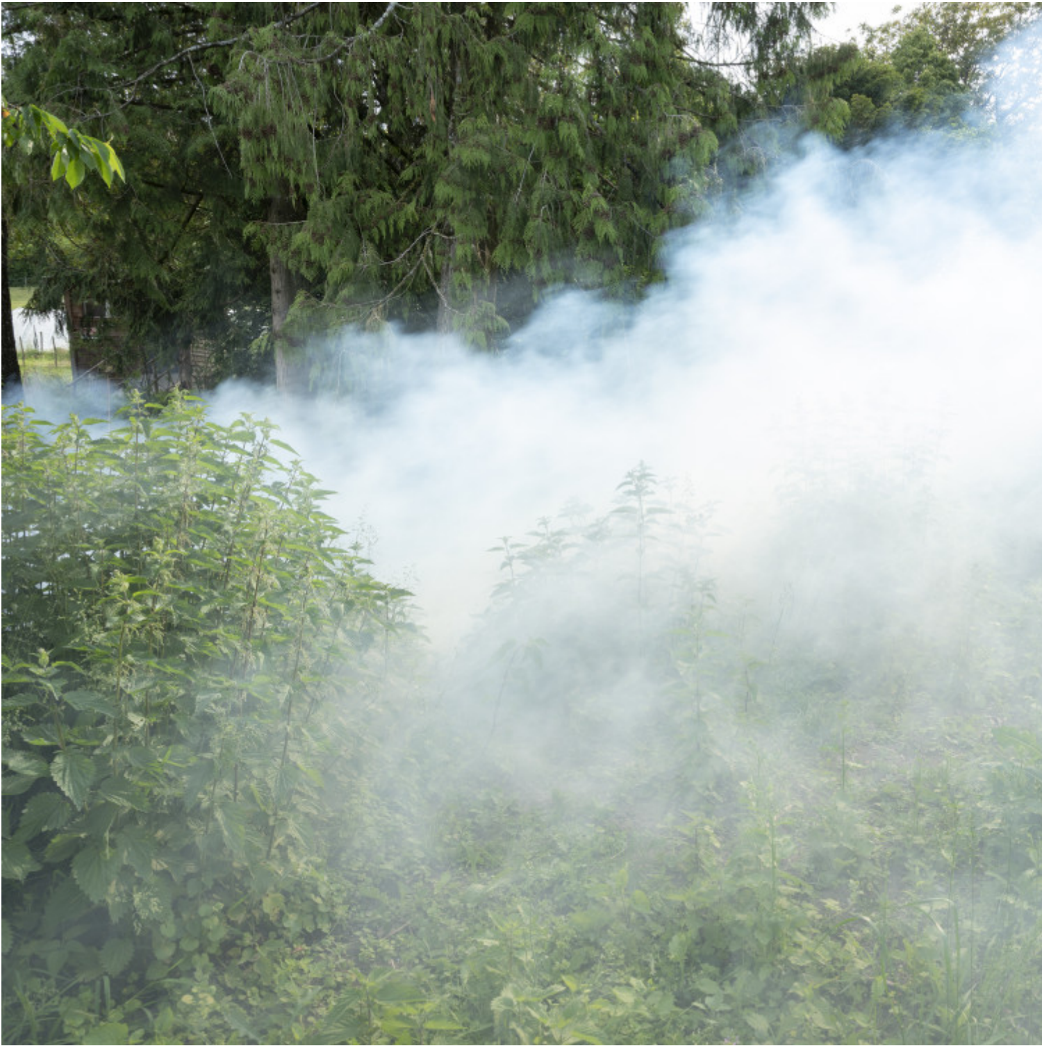
Shirin Yousefi, Untitled (detail), 2021.