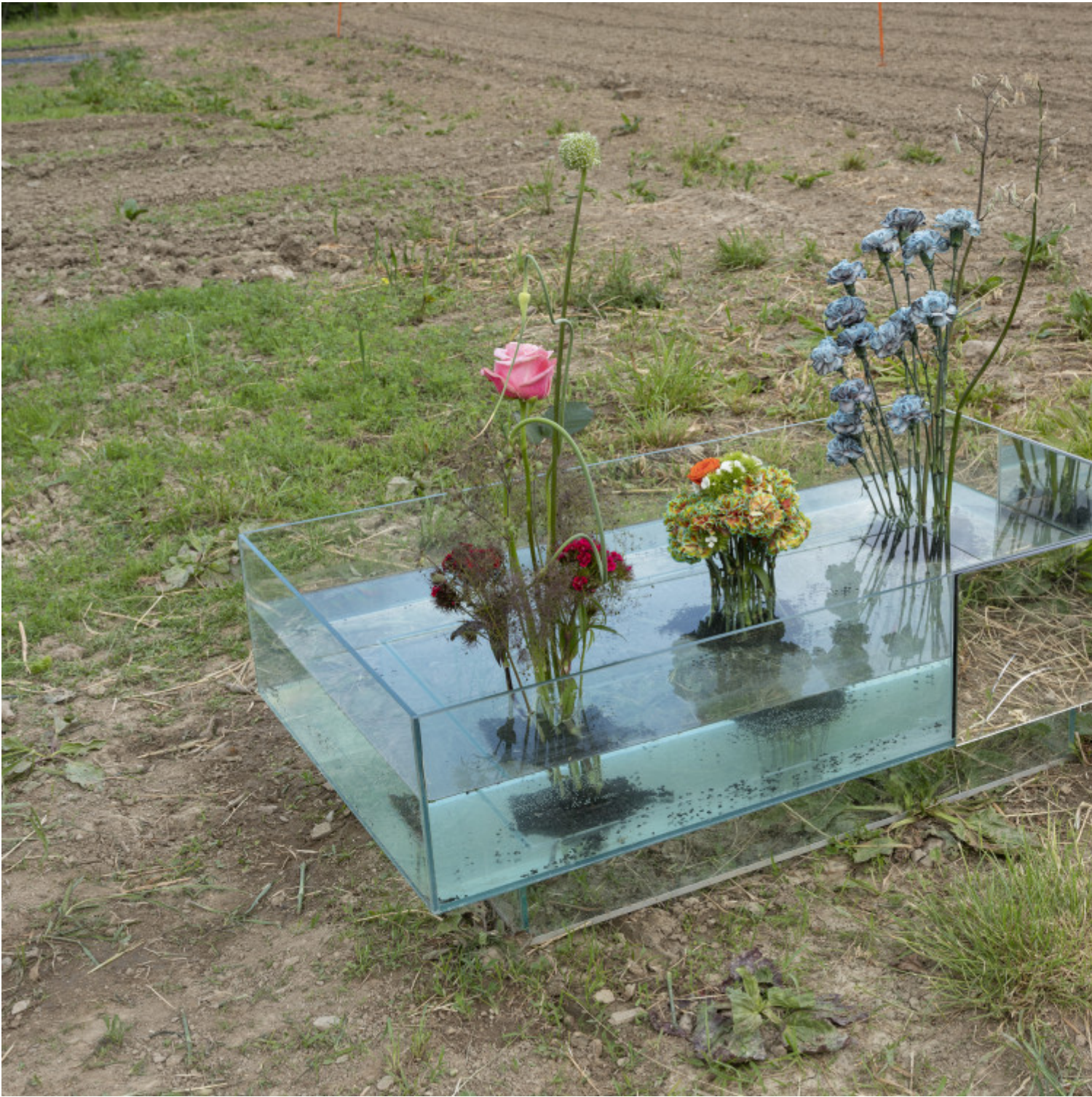
Ye Xe, Sample Slash , 2021. © Julien Gremaud