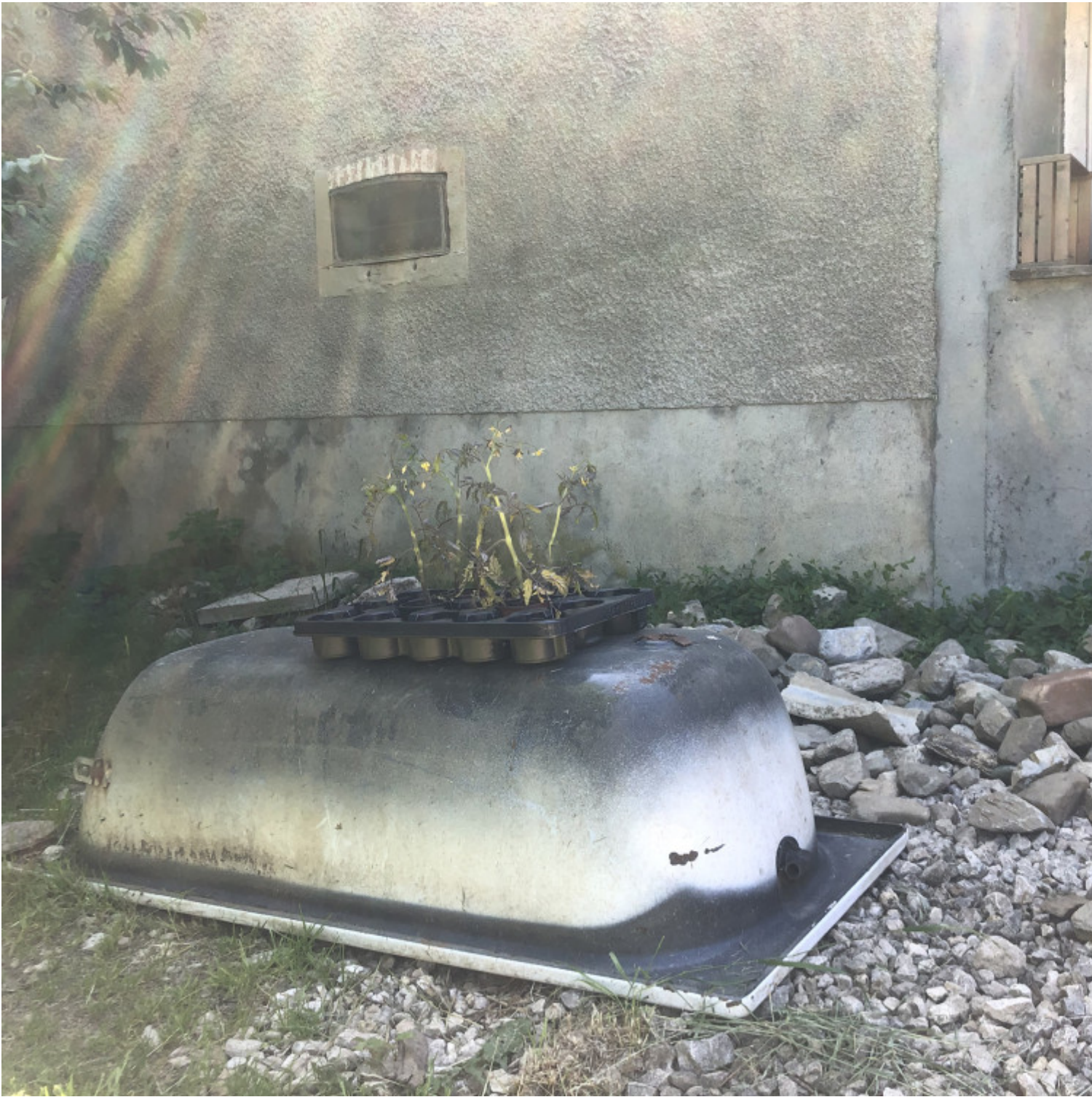
Biodynamic farm Les Eterpis, still life