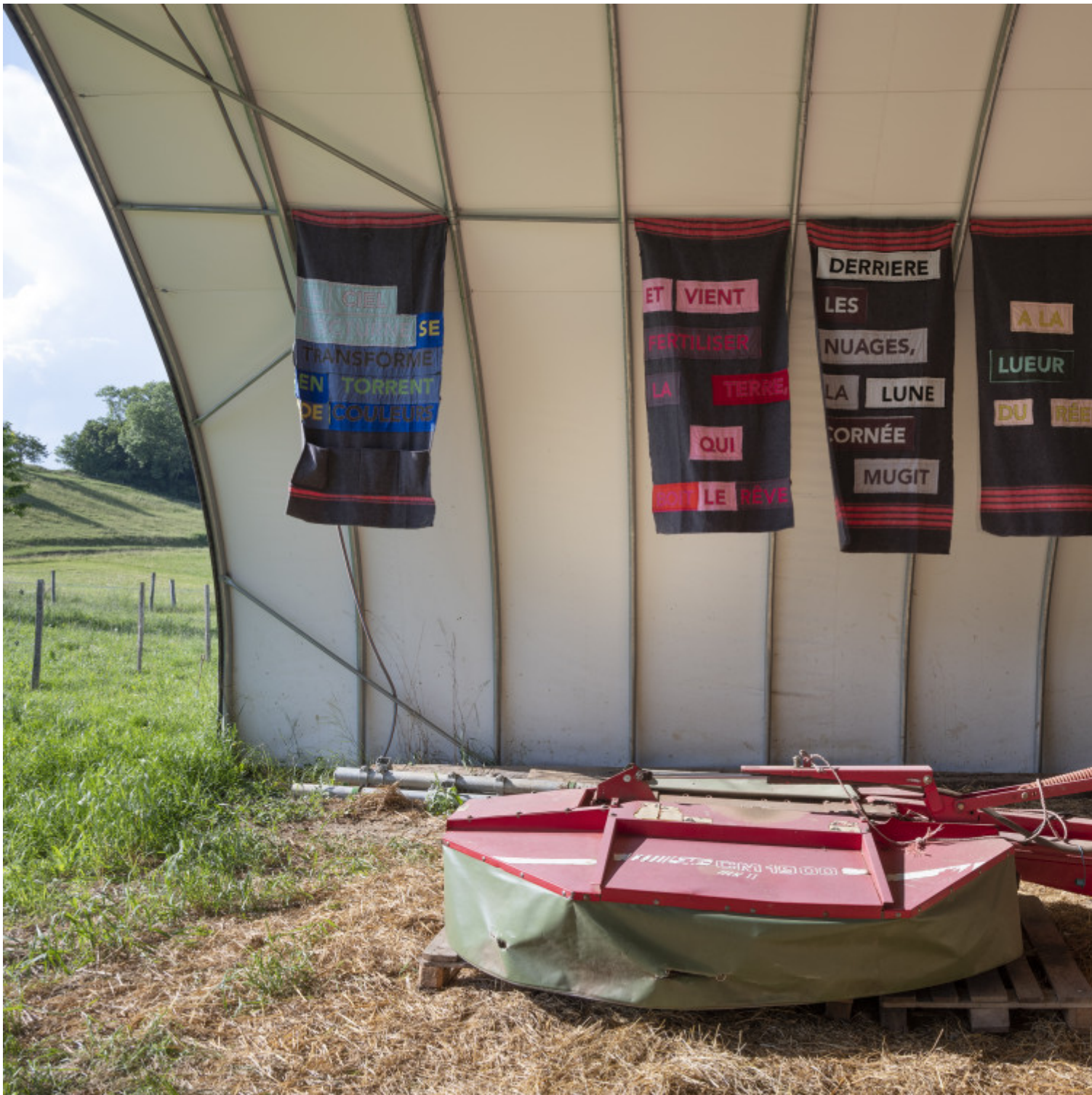
Andreas Hochuli, Les tombes sous les rhubarbes (detail), 2021.