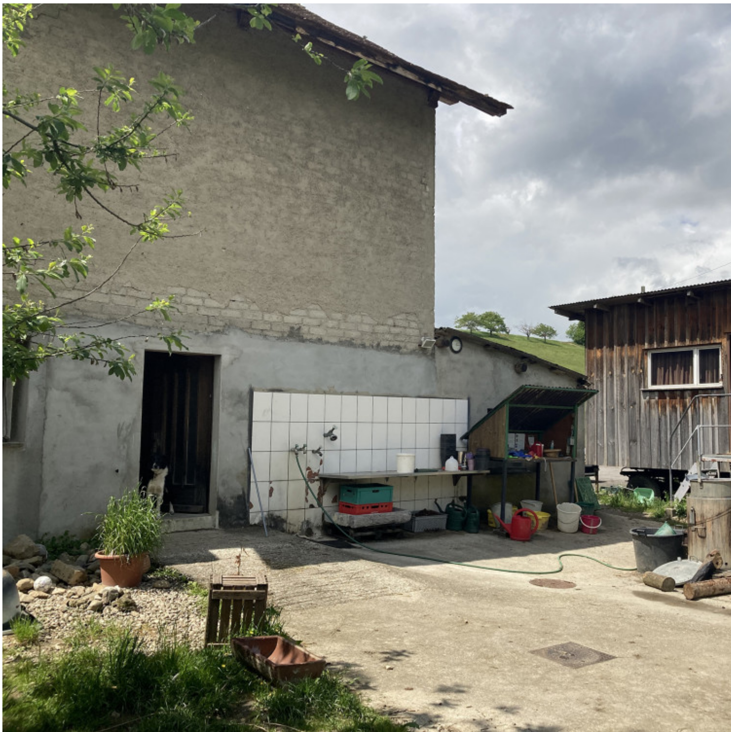
Biodynamic farm Les Eterpis, pig's kitchen