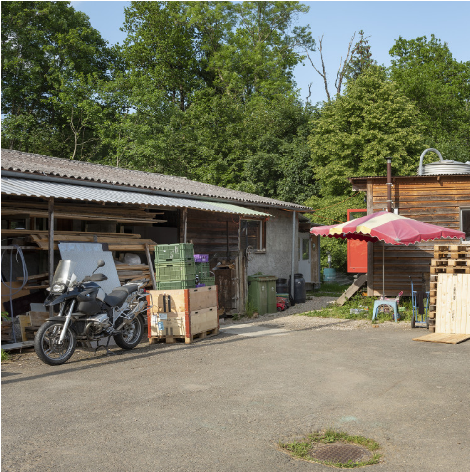
Biodynamic farm Les Eterpis.