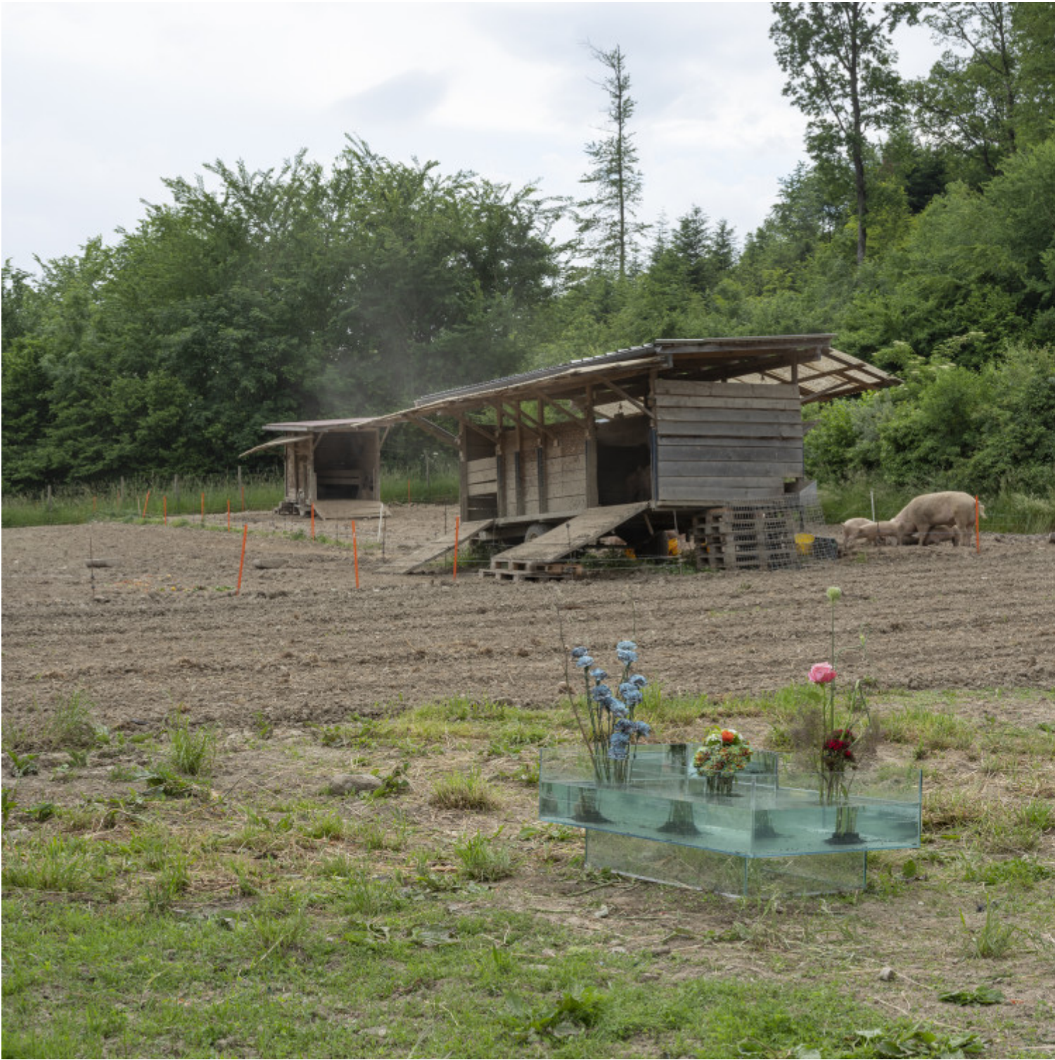
Ye Xe, Sample Slash , 2021.