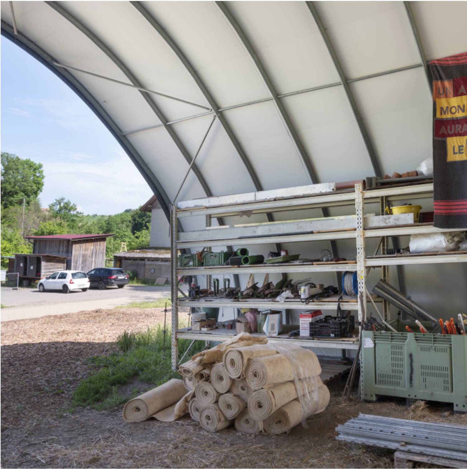
Andreas Hochuli, Les tombes sous les rhubarbes (detail), 2021.