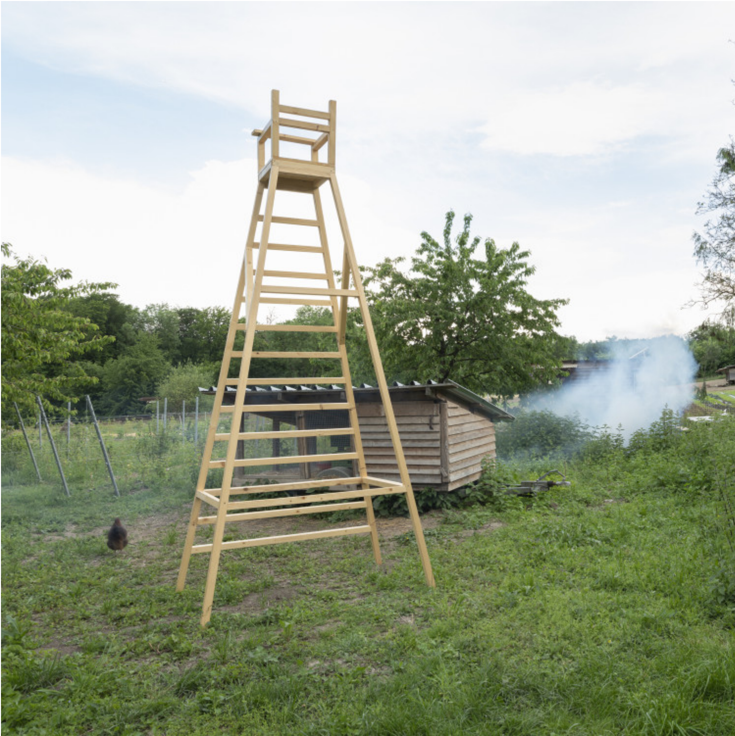
Shirin Yousefi, Untitled , 2021.