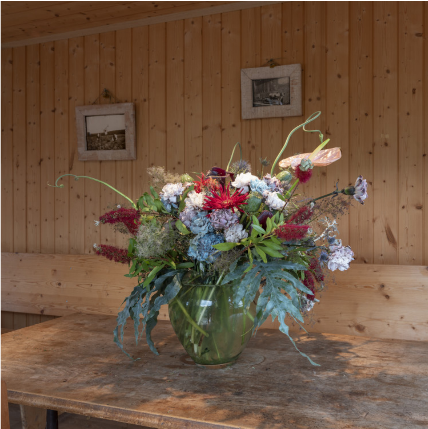
Les Vies génétiques d'Eden Martin, Ye Xe (table), Marc Elsener (wall), exhibition view .