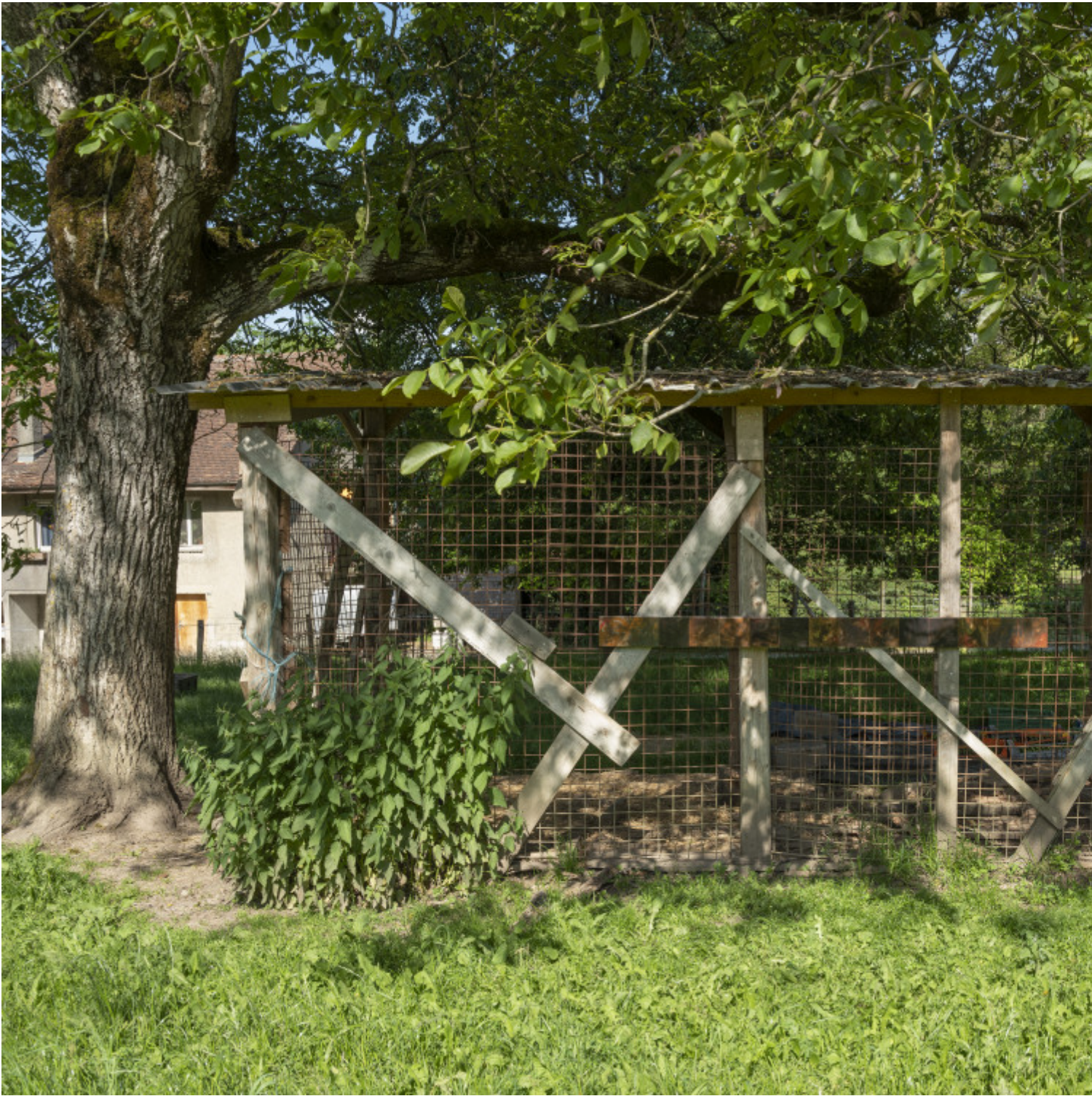
Séverine Heizmann, Puzzle soupe , 2021.