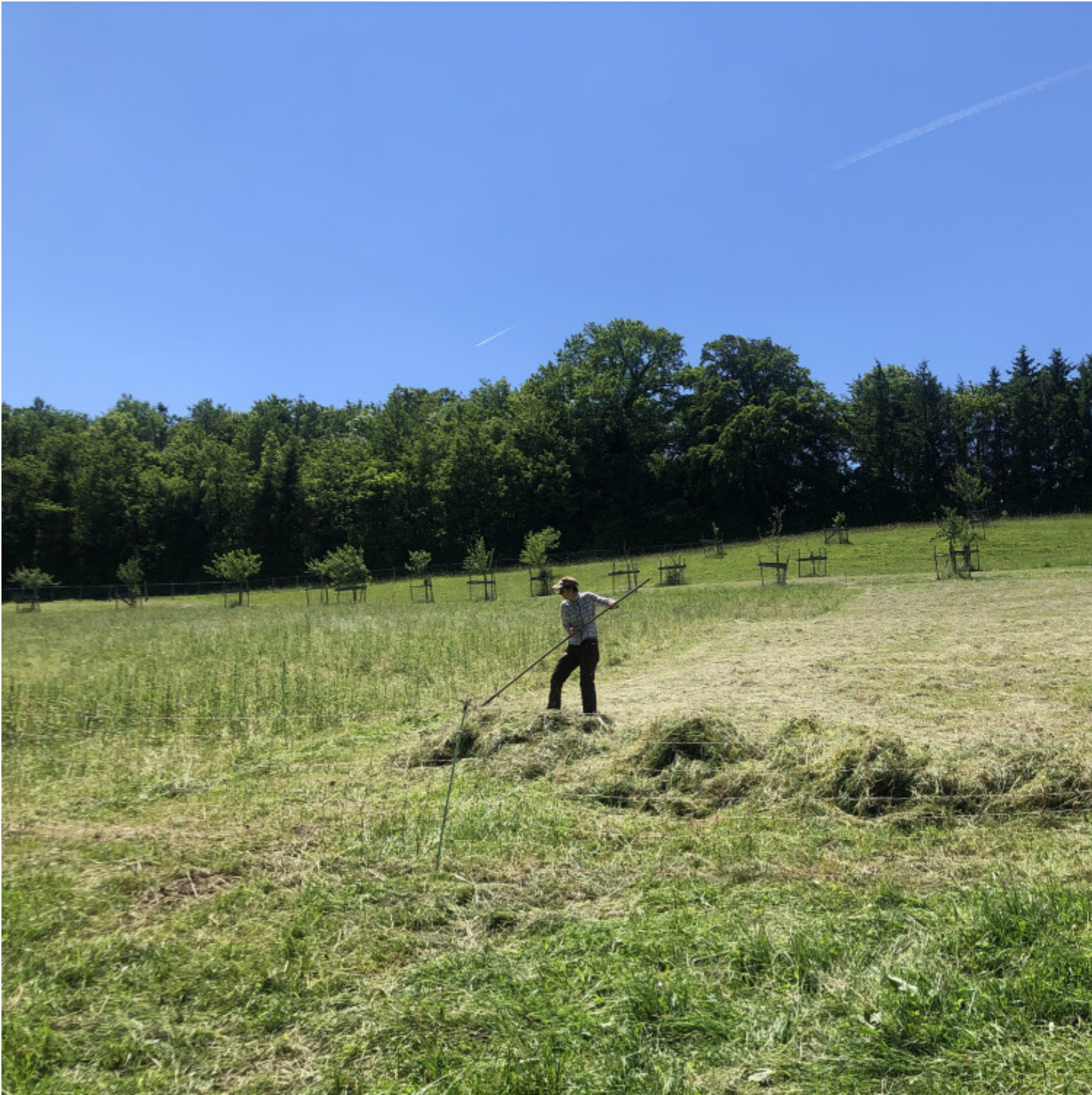
Biodynamic farm Les Eterpis, hay raking