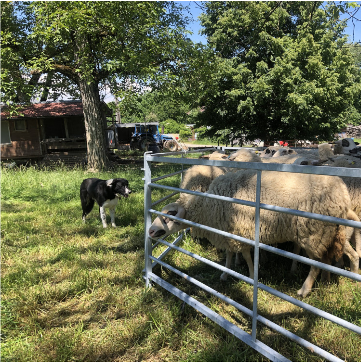
Biodynamic farm Les Eterpis, Arco watching the Pro Specie Rara Spiegelschaf sheep