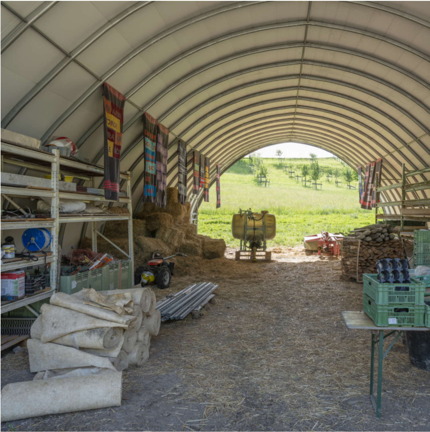
Andreas Hochuli, Les tombes sous les rhubarbes , 2021. © Julien Gremaud