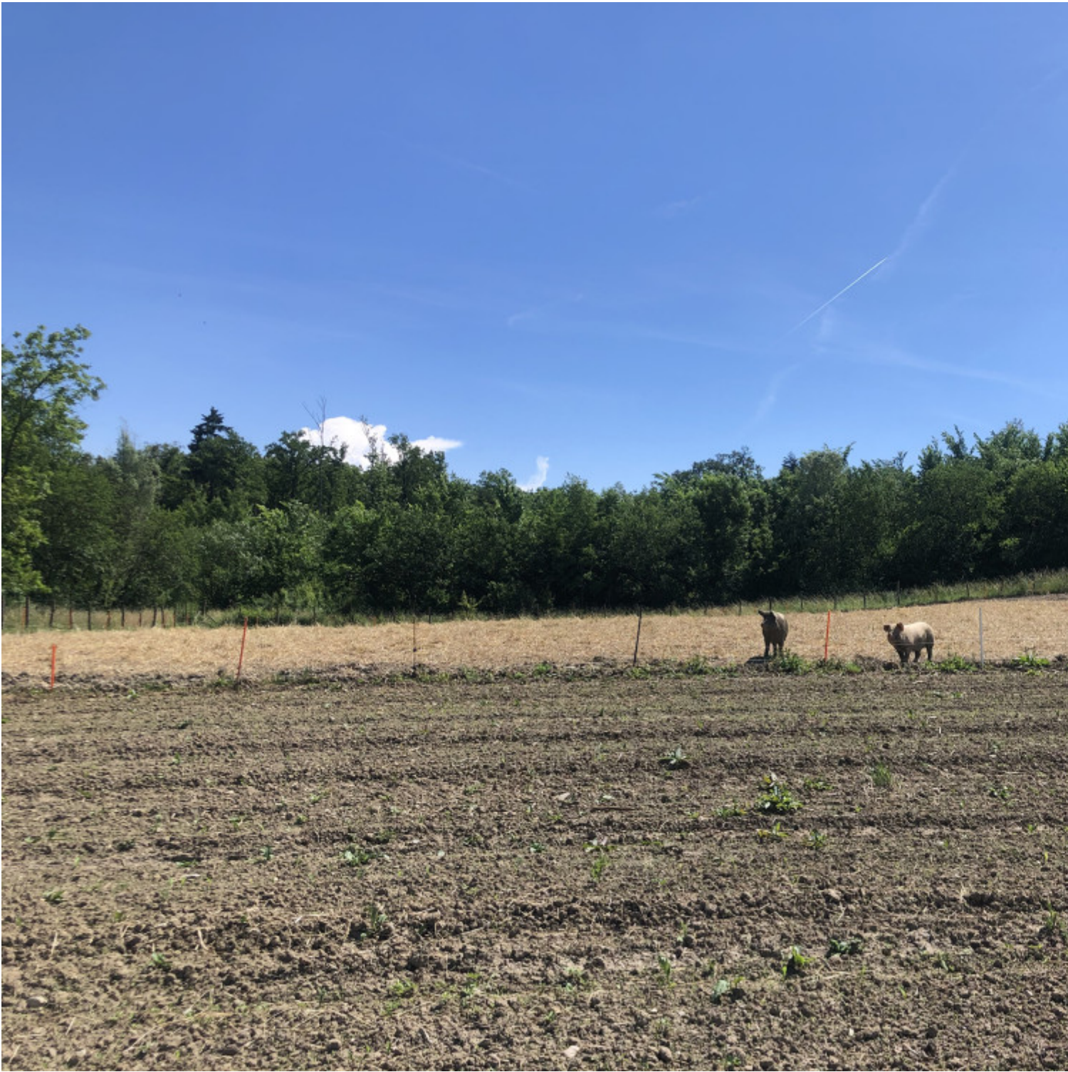
Biodynamic farm Les Eterpis