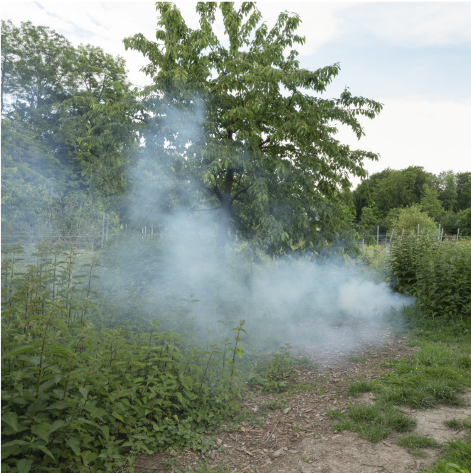
Shirin Yousefi, Untitled (detail), 2021.