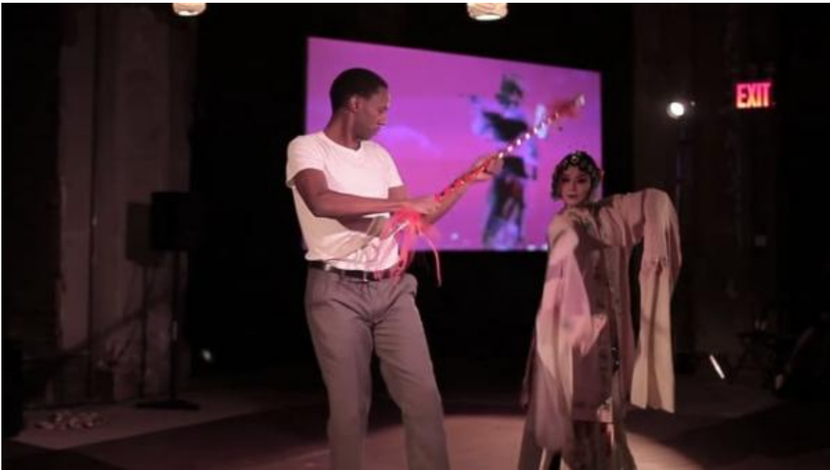
[ https://player.vimeo.com/video/187342844?autoplay=1&loop=1&automute=0 ]