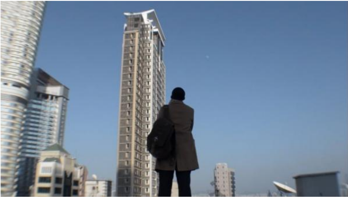
[ https://player.vimeo.com/video/187342829?autoplay=1&loop=1&automute=0 ]