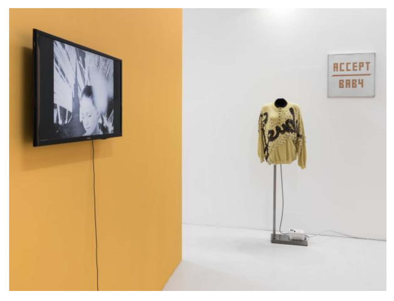
Accept Baby, Exhibition view, 2017.