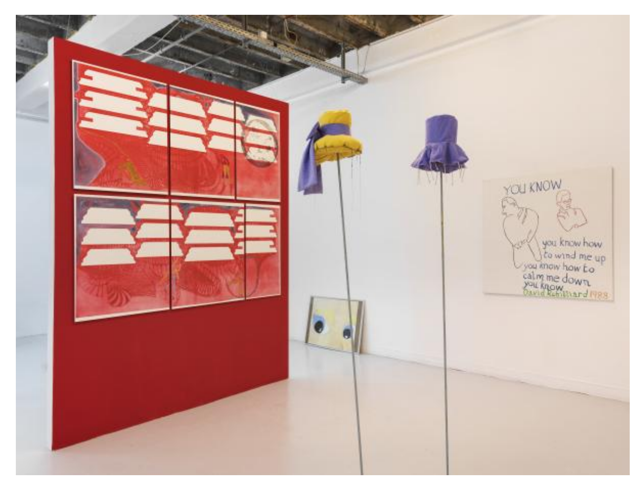
Accept Baby, Exhibition view, 2017.