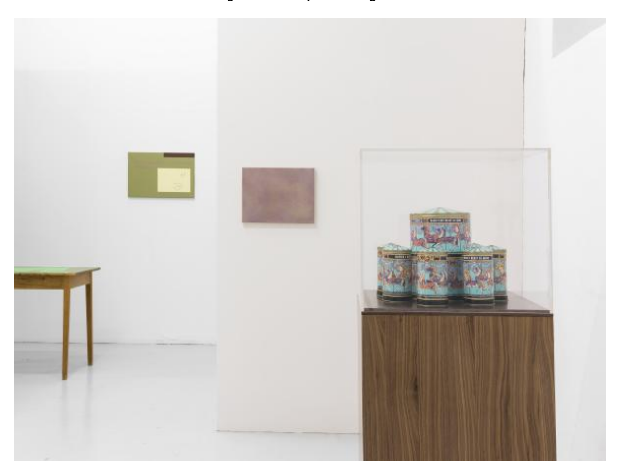
Accept Baby, Exhibition view, 2017.

usually found in display cases, we aimed at <setting the mood>, assembling covers as images and using titles for their tone, so as to evoke certain themes recurring throughout the show. Continuing the dialog after the show had ended, I went back to one of the texts included in the Accept Baby folder: Craig Owens' 1983 essay «Honor, Power and the Love of Women». [1] Why this text? Activating a historical text such as Owens' for a contemporary art show seemed to me to be posing the same question the works in the show were: How to take up historical forms and utilize them for the present, and how to turn such a re-reading of <classics> into a tool for an altogether more political agenda.