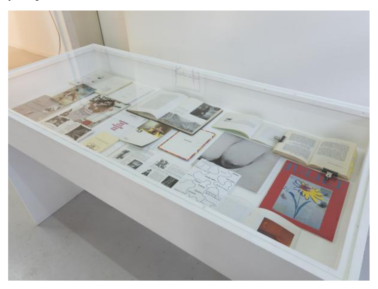
Accept Baby, book selection, 2017.

«Salon», the works take up symbols of a bourgeois lifestyle. Take Cédric Eisenring's two paneled pieces Industrial Dreamer 1&2 : The works depict costumed figures, clad in tailcoats and top hats, in a distorted, topsy-turvy world. They seem to fall out of time, apparently unfazed by contemporary aesthetic. Then there is Daphne Ahlers' Fotzen , Fotzen , Fotzen , Fotzen – irgendwo ist St. Pölten : Two pretty ladies' hats on fine stands, whose intricate decorations on closer inspection turn out to be contraceptive coils and pearl sex toys. And bejeweled necklaces by Gabi Dziuba and Hans-Jörg Mayer, exhibited in vitrines, enhanced as fetishes, the words «Accept» and «Baby Baby» again a riddle, referring back to Mayer's painting on the other side of the wall.