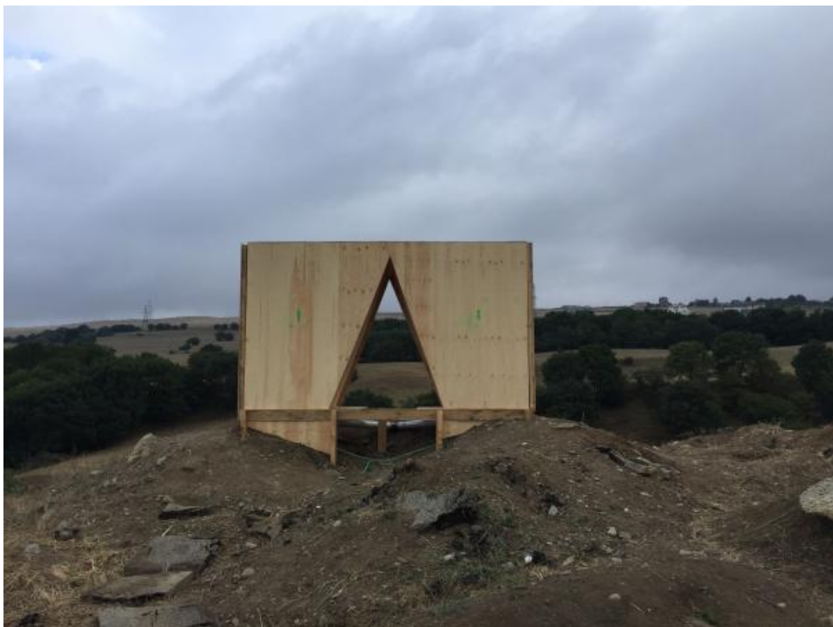
Construction by Gela Patashuri, front view