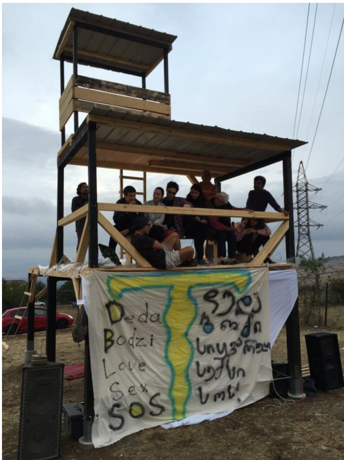
Sexperts by Deda Bodzi