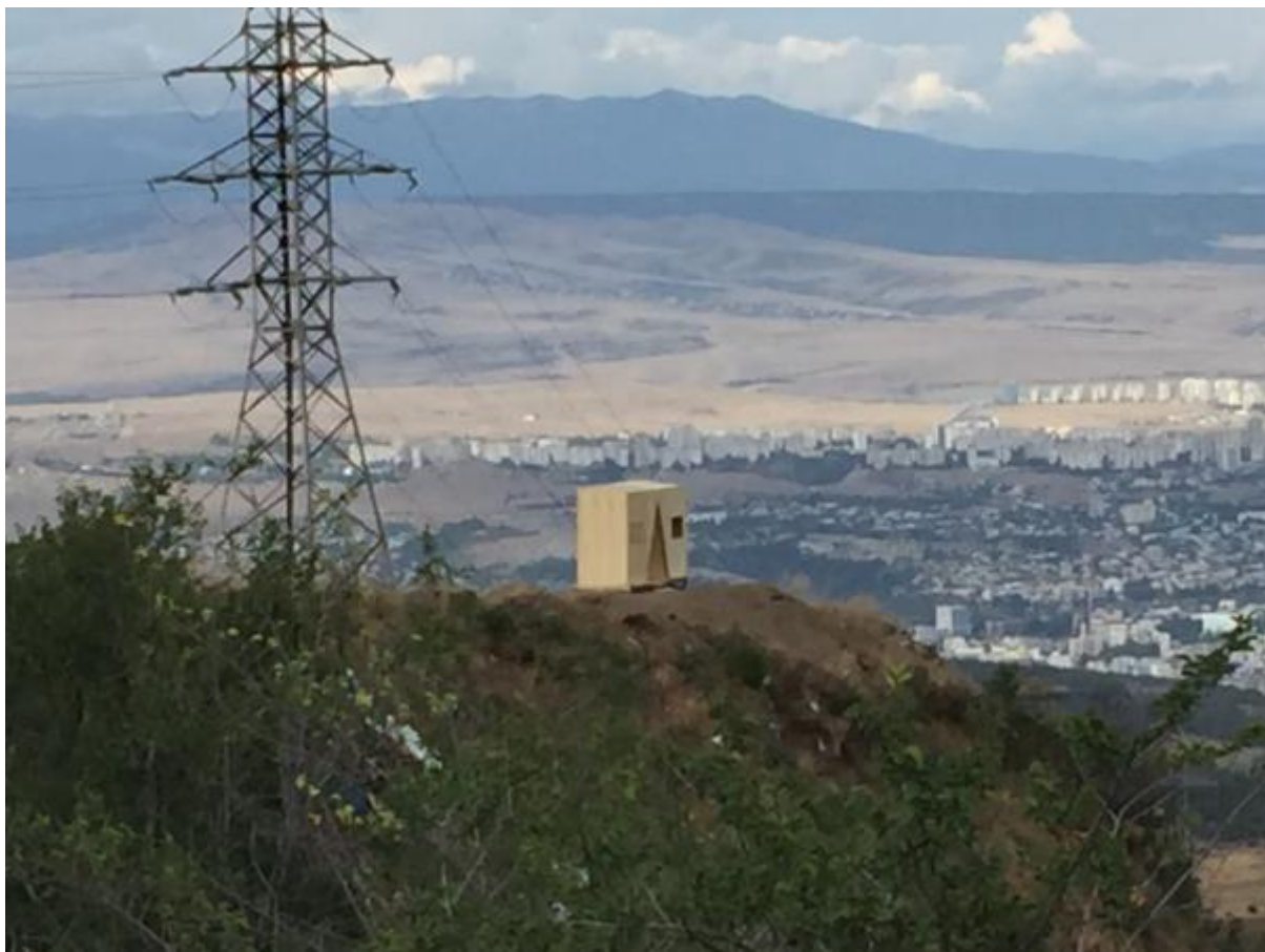
Construction by Gela Patashuri