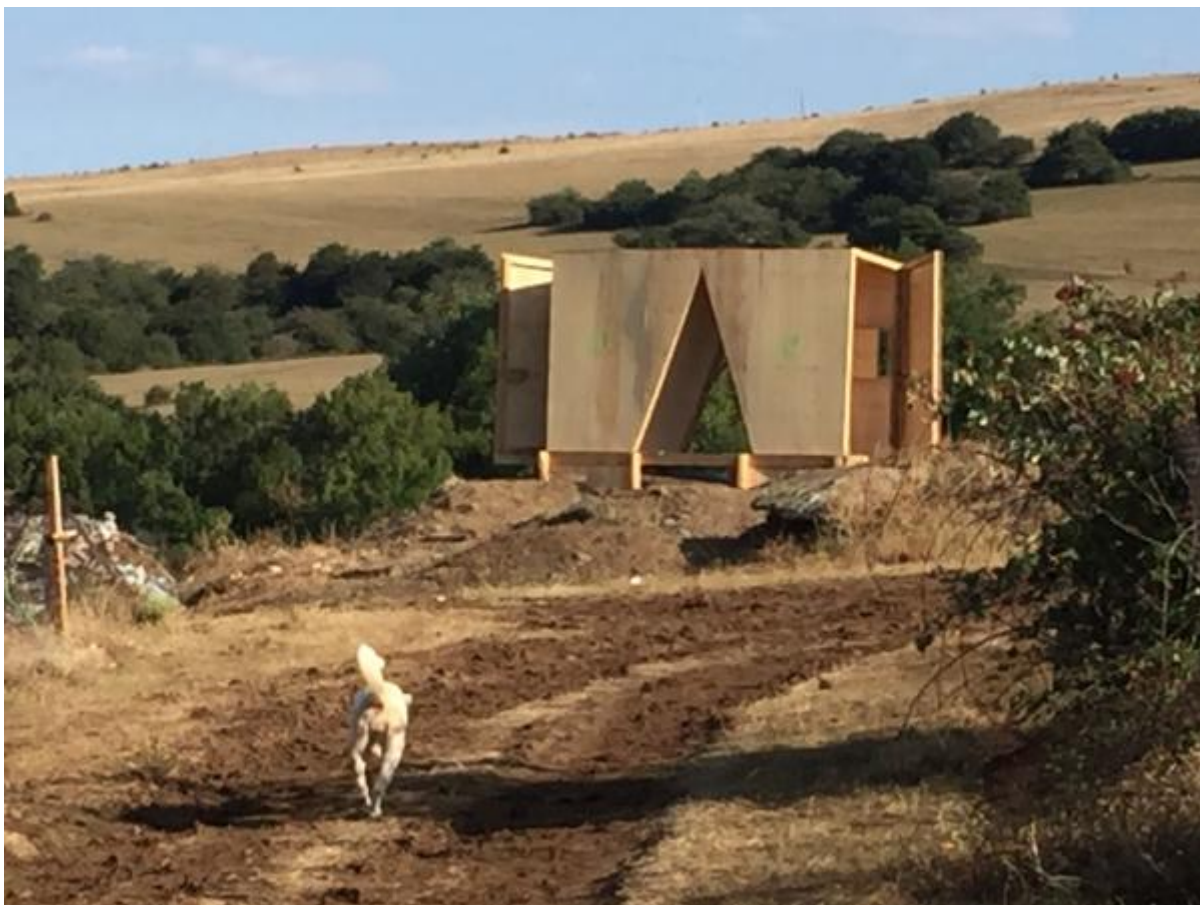
Poppers and building by Gela Patashuri