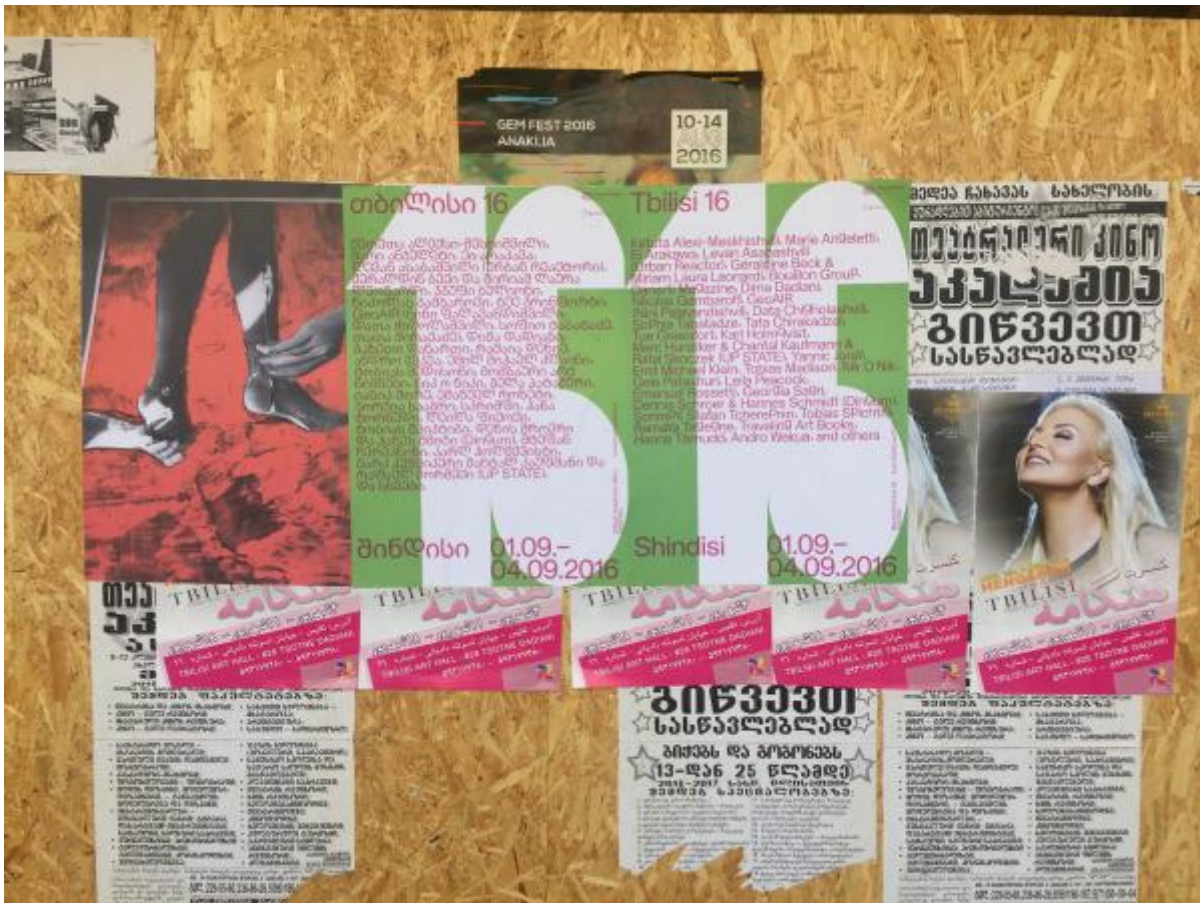
Poster for Tbilisi 16