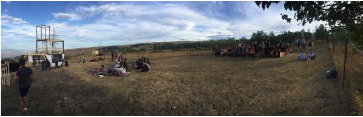
Panorama Tbilisi 16