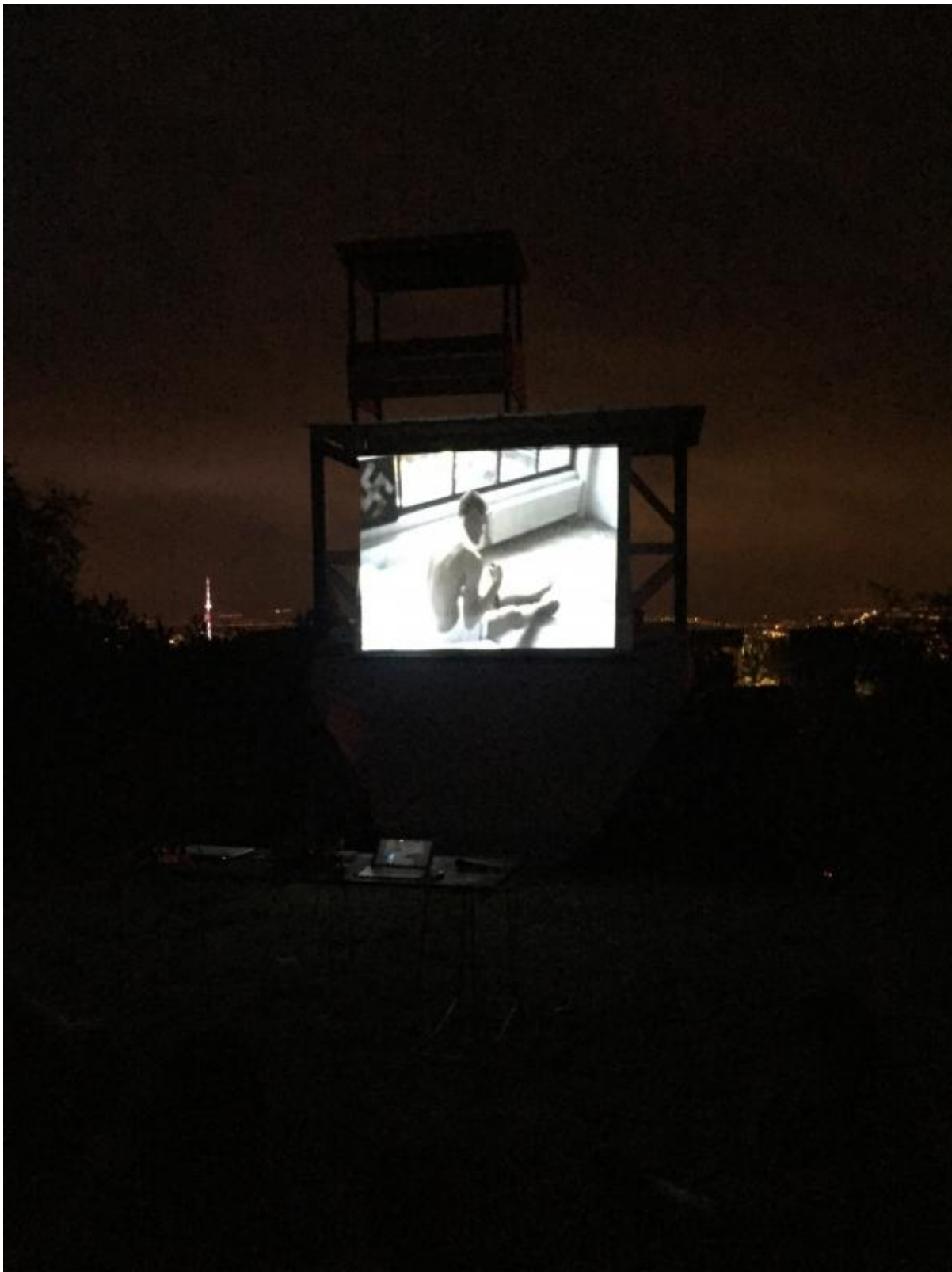
Screening Nik O Nik