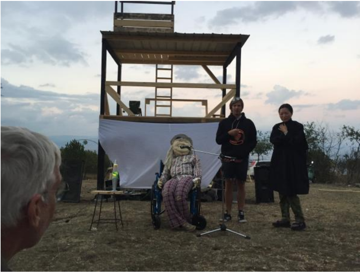
Tobias Madison Red Lace Moon Unit, Black Comet Cometh! presented by Dingum