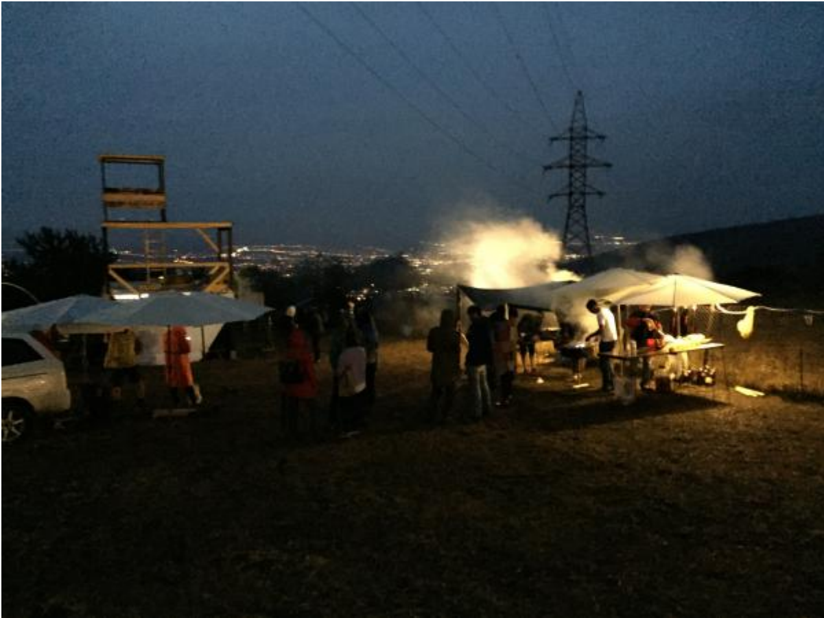
BBQ with Andro Wekua