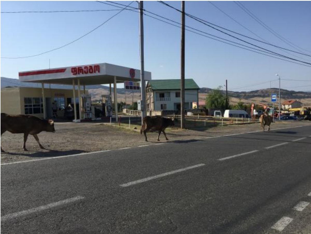
Kühe in Shindisi