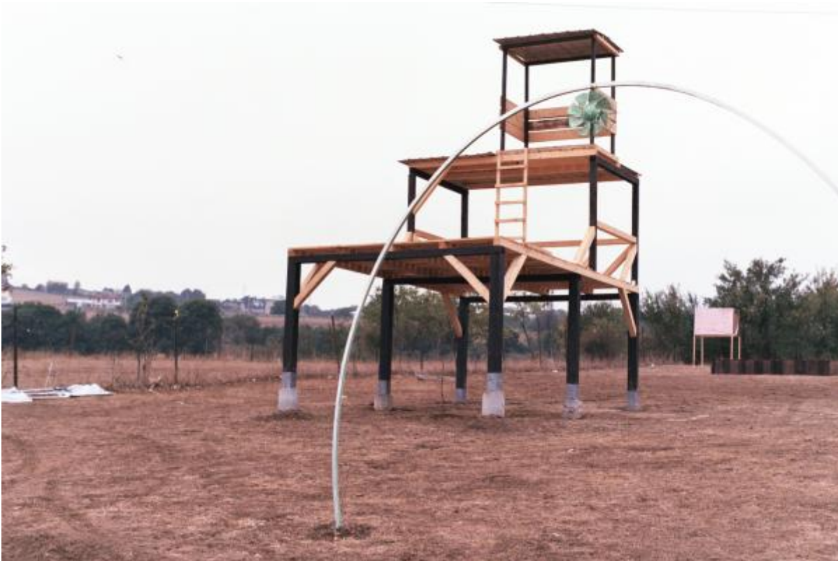
Treehouse by Upstate with entrance gate by Georgia Sagri