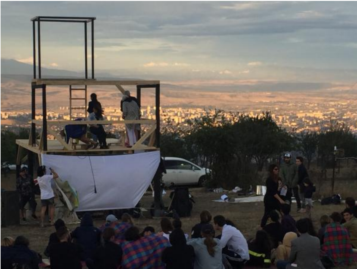
Opening Tbilisi 16