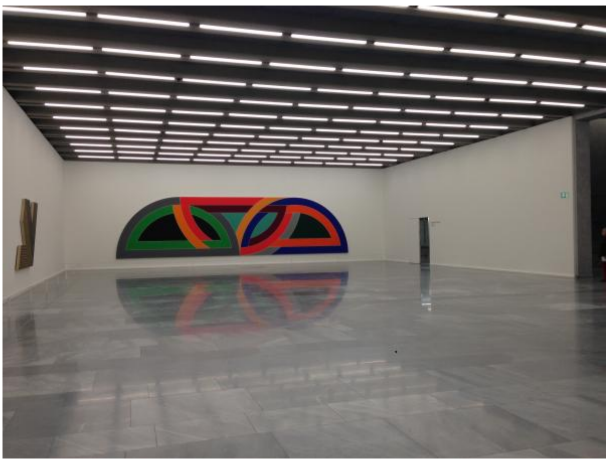
Function room, extension of the Kunstmuseum Basel, 2016.

churches or government institutions), this staircase serves above all to demonstrate the monumentality of the spaces.[9]