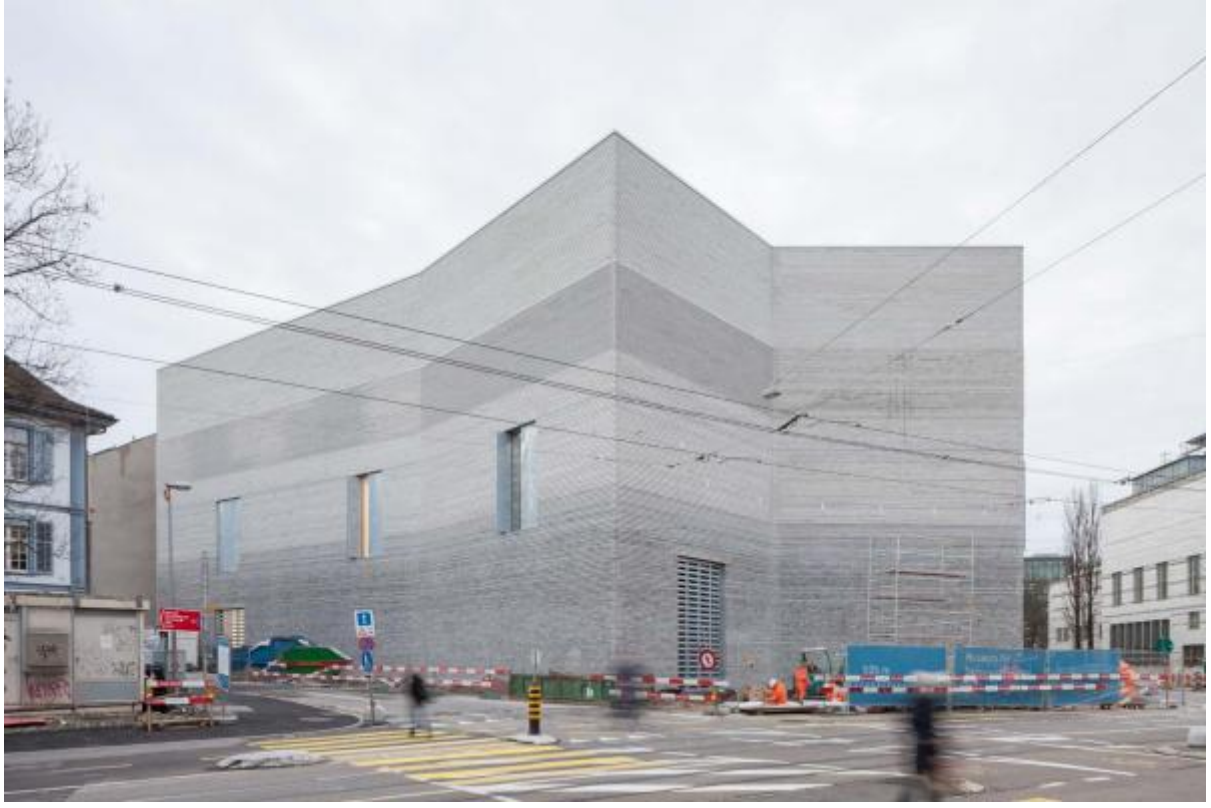
Extension of the Kunstmuseum Basel, 2016.

Going by the press releases, Basel saw «one of the oldest public art collections of the world become one of the internationally most prominent museums» this spring. The Kunsthaus Zürich—funded by what is, «after Tate, the second largest art association in Europe»—will become the «largest and most dynamic art museum in Switzerland», once its extension is completed, and in Chur the museum's established image is further strengthened. On the websites of the respective museums one can find the new quantitative potency pre-calculated: greater attendance, greater reach, more space. Zürich expects to be able to display 20% (compared to 10% today) of its holdings; Basel announces a 29% increase of its floor area and the Bündner Kunstmuseum even speaks of almost doubling its floor area. The announcements brim with confidence, euphoria and optimism for the future.