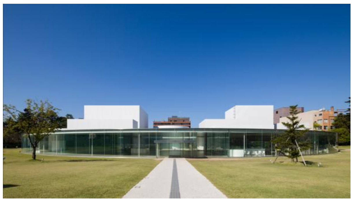
Museum of Contemporary Art in Kanazawa.

These new Swiss museum buildings contrast with some international museum projects from the 2000s particularly in terms of their materiality. On the occasion of the 2004 opening of the renovated and expanded building of the Museum of Modern Art in New York—an architecture made mainly of glass and steel—Hal Foster still referred to a disappearance of architectural presence in the museum building, quoting Yoshio Taniguchi, the architect of the new MoMA, to make his case: «Raise a lot of money for me, I'll give you good architecture. Raise even more money, I'll make the architecture disappear.»[6] In the case of the Museum of Contemporary Art in Kanazawa, which also opened in 2004 and is likewise made mainly of glass and steel, the pavilion architecture creates an inviting permeability and an interactive element in the possible lines of sight between museum spaces and the surrounding public park setting. In this way the art museum becomes part of an urban recreational space.