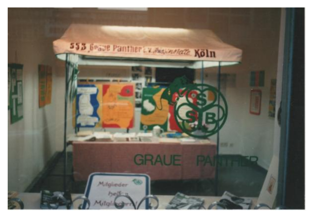
Exhibition view of Grauepanther at Friesenwall 120, Cologne, 1990

RT: Why were you invited to participate in the project? What was your contribution to it?