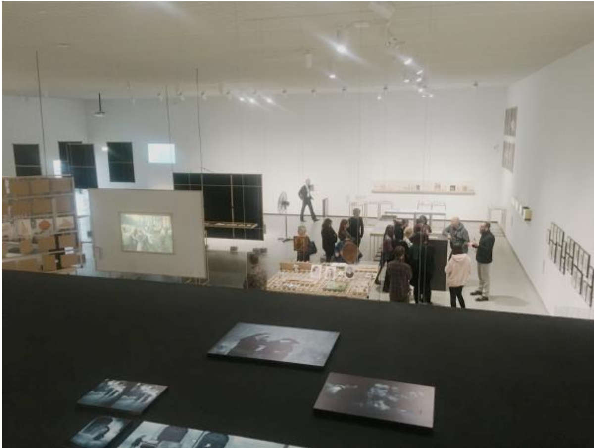
You've Got 1243 Unread Messages , 2017, exhibition view.

publications circulating in a relatively controlled environment function as a safe space for otherwise censored content. It shows the effectiveness of underground networks in areas where censorship is proactive. At the same time it points to the connections between political and aesthetic opposition.