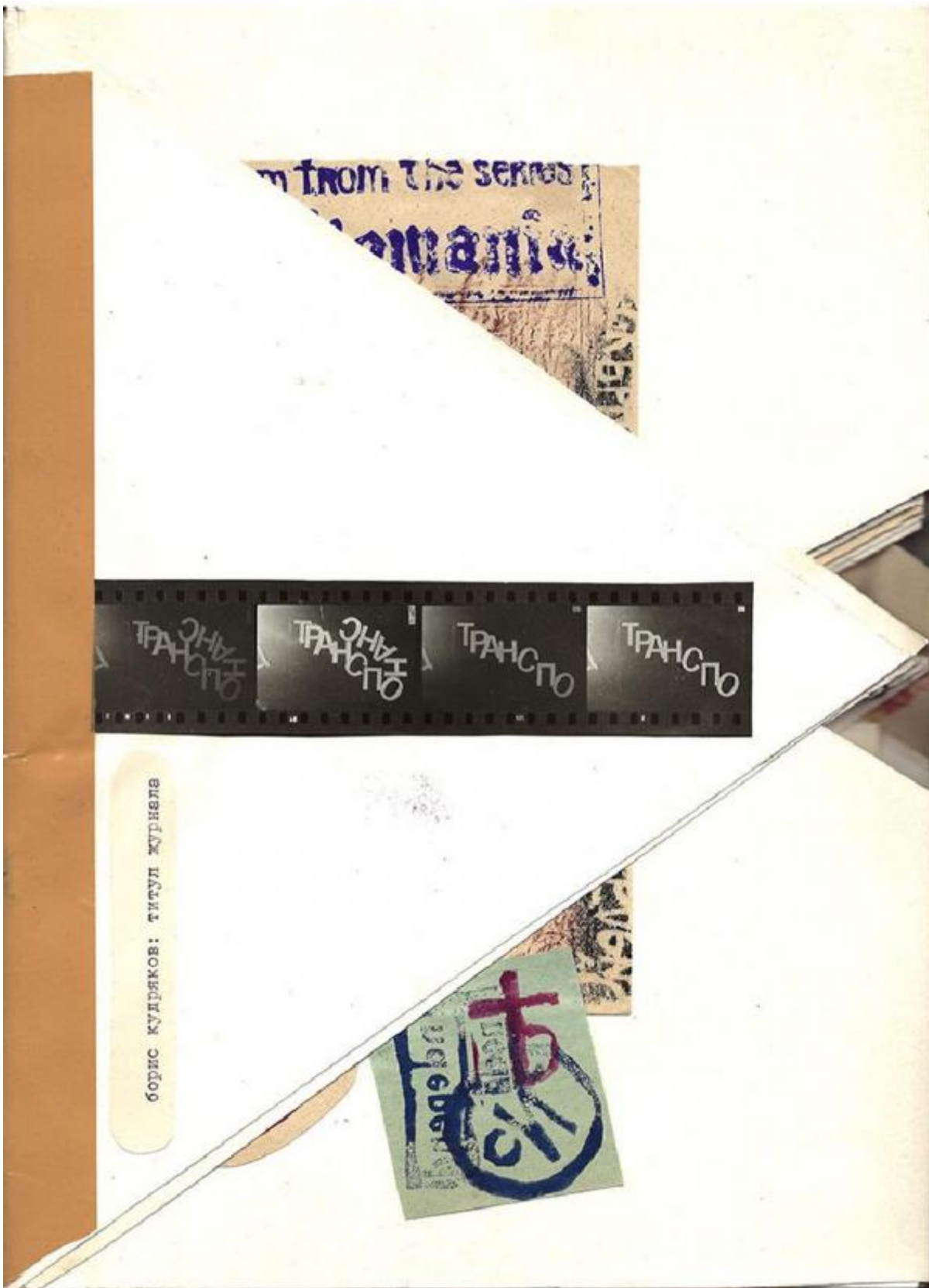
Transponans , Issue 36, 1987