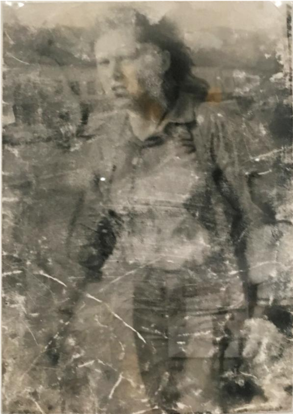
Miroslav Tichý, Untitled, s.a., Courtesy Delmes & Zander Cologne.

I can't sketch a way out of the mess we're facing as a result of feeding an apparatus with the connections we make with other people and the things and thoughts we want to develop further. As a whole, the works shown in You've Got 1243 Unread Messages punctuate the basic fact that media cannot be understood simply as an extension of our eyes and ears: we do not simply use media but are, as fundamentally social beings, in fact defined by them. While