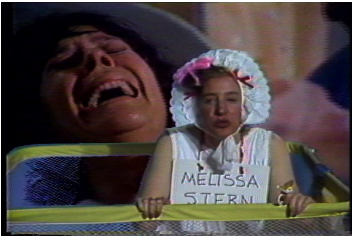
Still from Martha Rosler, Born to Be Sold: The Strange Case of Baby M/S , 1988, 28 min