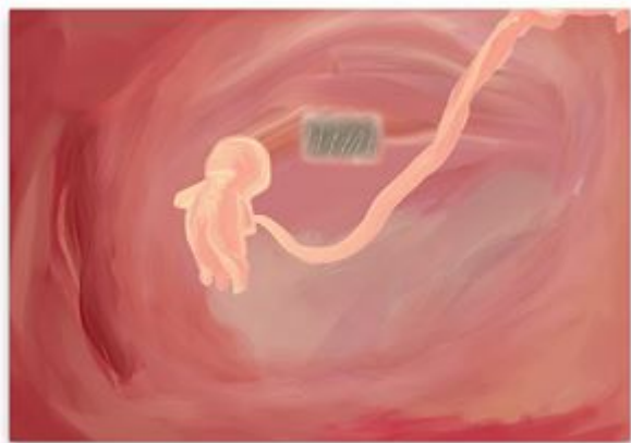
Stiil from Tala Madani, The Womb , 2019, 3 min