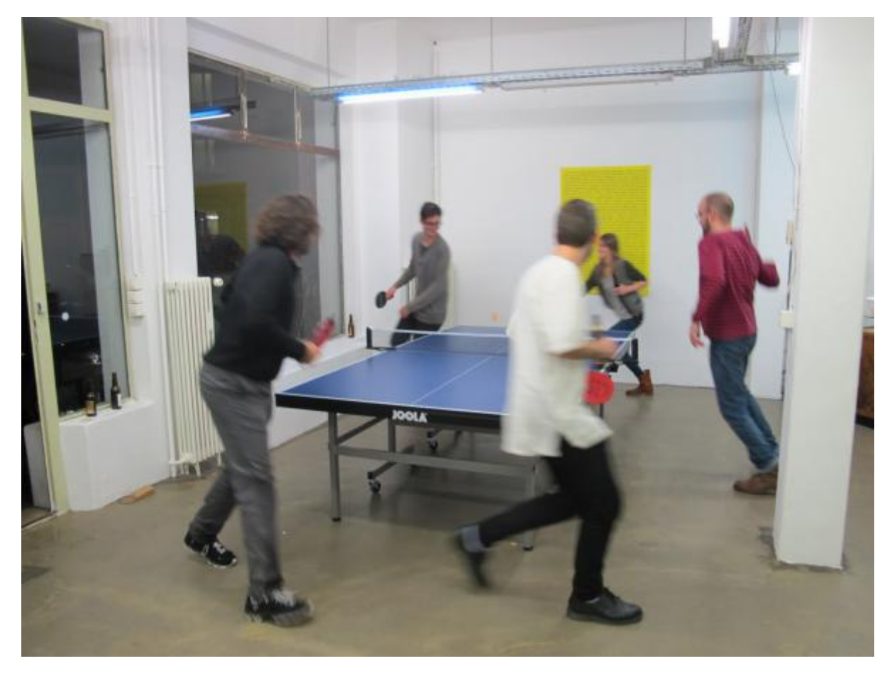
Session 100. 3 Years / 100 Sessions Theory Tuesday, Corner College, Zürich, October 9, 2012.

Müller: Do the group readings influence your own artistic practice? If so, can you give an example?