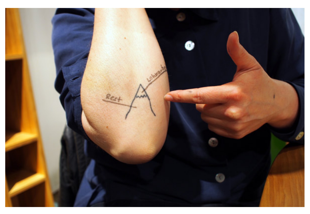
Session 159. Das Theorem der neuen Landnahme. Eine feministische Rückeroberung by Die Feministische Autorinnengruppe, Reseda Lochergut, April 5, 2016.

Concerning generating a <common ground,> I see the weekly repetition of <when> (Tuesday at 8 pm) and <where> (Reseda Lochergut Showroom in 2016) as enough to demarcate this territory of theoretical discussion in the art landscape of Zürich. Another common ground is the table where we sit during each session. Nothing is recorded from the discussion to be published online afterwards. It's about being in the same room at the same table with people you've most likely never met before, discussing a text that interested someone enough to present and open it up for discussion. So the table is also an important, a physical ground where we always meet.