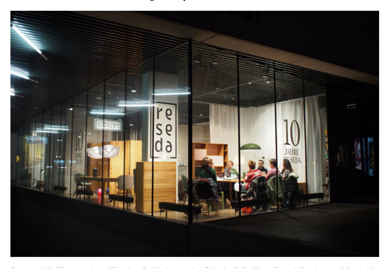
Session 158. Hinter weissen Wänden. Behind the white Cube by Julia Voss, Reseda Lochergut, March 15, 2016.

But what does it really mean to be critical? In my opinion it's providing a setting / mindset where a wide variety of conflicting viewpoints on current topics can be expressed, examined and discussed on equal terms. The above-mentioned writers and positions only represent a very small scope of what's been read and discussed at Theory Tuesdays. So far we've had 160 sessions and the theoretical range is very wide.