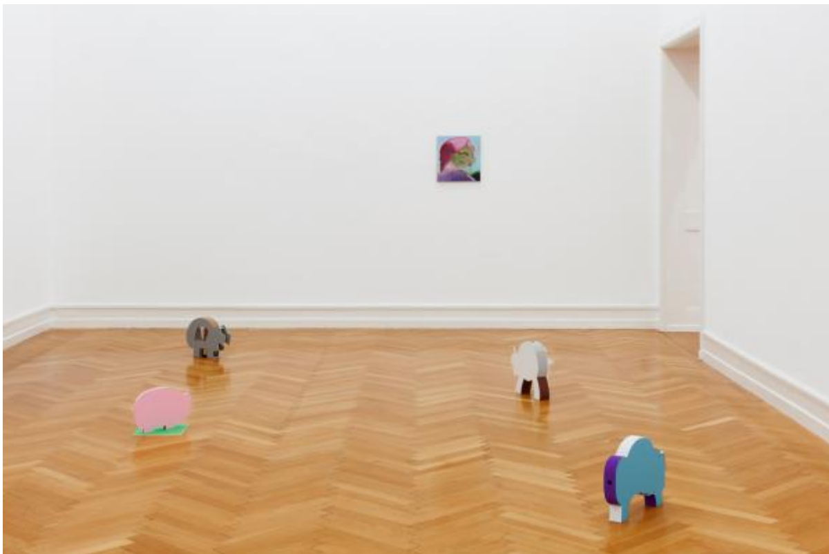
Vittorio Brodmann, Squeeze Machines , 2016, various materials, Photo: Gunnar Meier.

The exhibition in general, in the scheme of Brodmann's oeuvre, becomes one of opening doors and tearing down boundaries. The sandstone sculpture in the first room, Chain of Events (2016), is a stoic bear relating to the permanent tables in that space. It's site specific wit, but shows an early and unexplored gift for carving. The same goes for Squeeze Machines (2016), a set of small, thin piggy banks made of corrugated cardboard and children's craft materials (save for a beer bottle). Beyond the artist's talent for the painted form of bizarre figurations and colorful paths lies an intense need to tell convoluted and open storylines. His is a skill for imbibing what he touches with intense emotions and deep felt humor while refusing the insular, the clubby or any inside jokes. Brodmann stands apart from his peers in his desire and execution of a new direction in painting, one where traditional gendered sensibilities of the medium are abolished for something much more accessible, boisterous and broad. This is art at its most generous without any sacrifice of quality or aspiration and Brodmann, during his first major opportunity, has chosen risk over safety. Accomplishment and achievement are beyond the point, the show is a pleasure to take in.