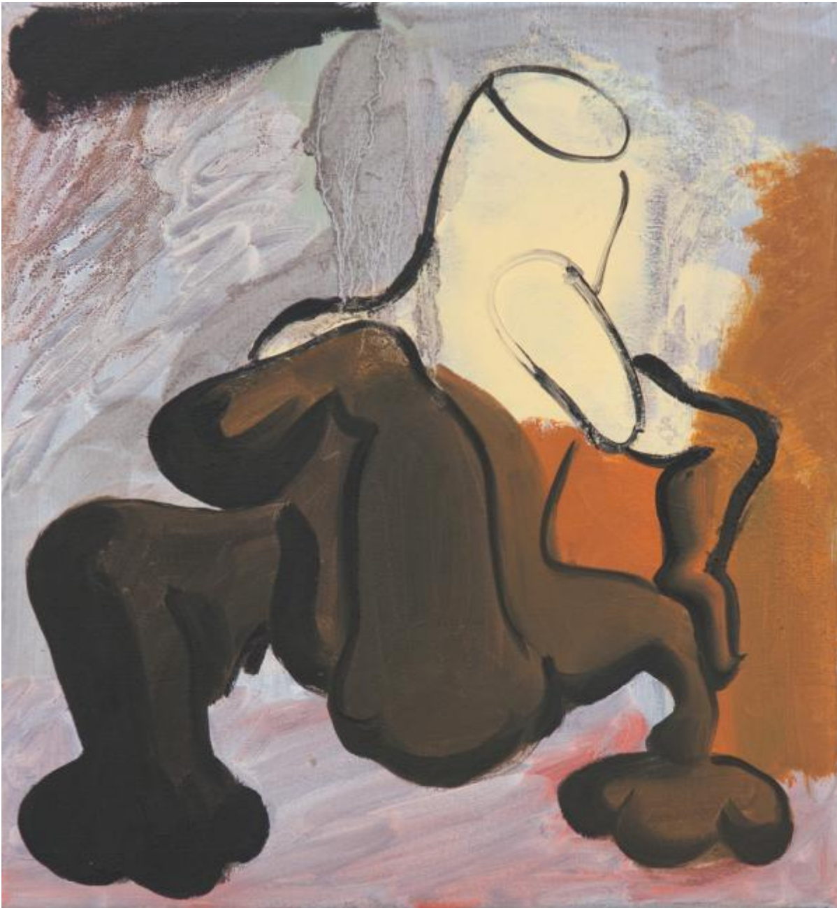
Vittorio Brodmann, Drowning on Dry Land , 2013, oil on canvas, Private Collection, San Francisco / Image: Courtesy the artist and Galerie Gregor Staiger, Zurich.

goldenrod strokes comprise its entirety, with the central image formed by a cartoonist's line of sturdy black. It reminds one, though not fully, of the broom figures from The Sorcerer's Apprentice in Walt Disney's Fantasia (1940). It is iconic of the way that the artist has been able to anthropomorphize imagery with true feeling and humor and harness popular forms of representation without succumbing to the limits of directly referencing pre-established culture.