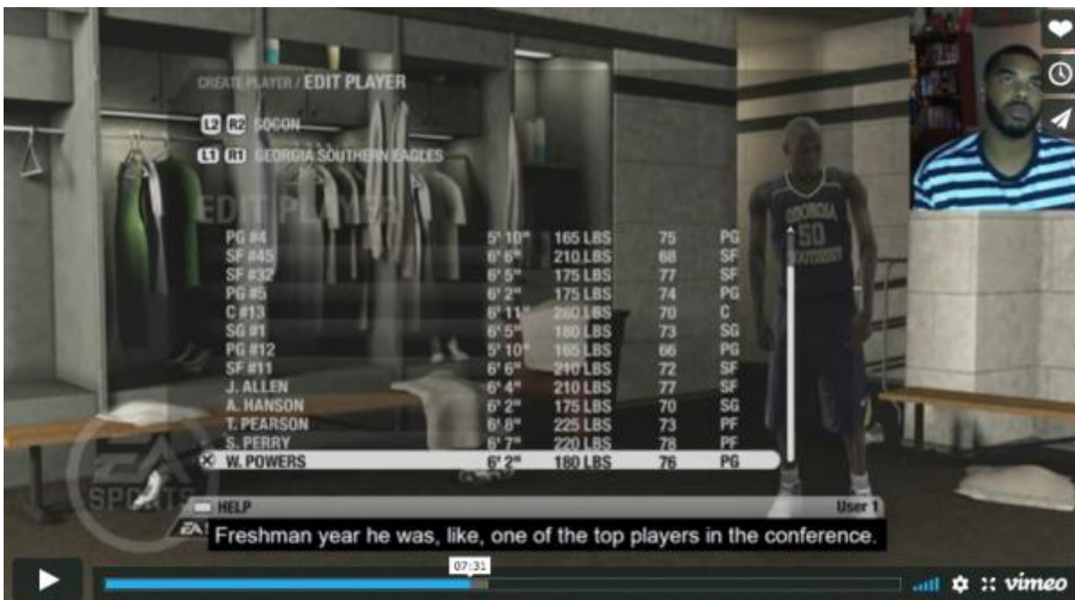
Sondra Perry, IT'S IN THE GAME '17 or Mirror Gag for Vitrine and Projection , 2017, video 16:21 min, video stills (by the author) > hyperlink: http://sondraperry.com/IT-S-IN-THE-GAME-17 [http://sondraperry.com/IT-S-IN-THE-GAME-17]