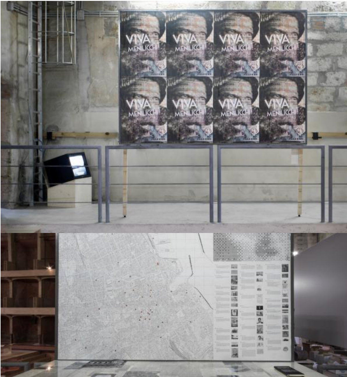
Wu Ming, Viva Menilicchi!, 2018, mixed media